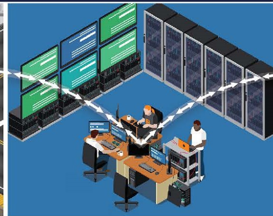
Traffic Operation Center