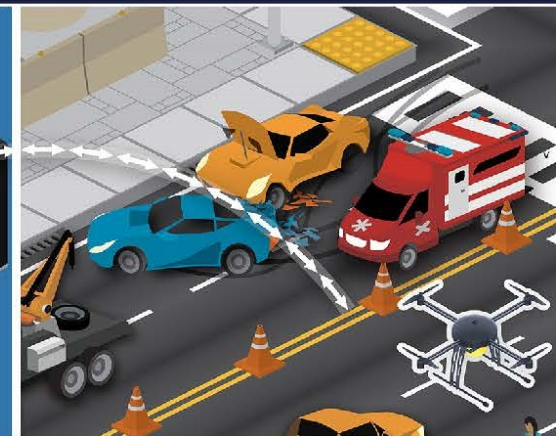
Traffic Incident Response

Source: https://www.fhwa.dot.gov/innovation/everydaycounts/edc_6/nextgen_tim.cfm